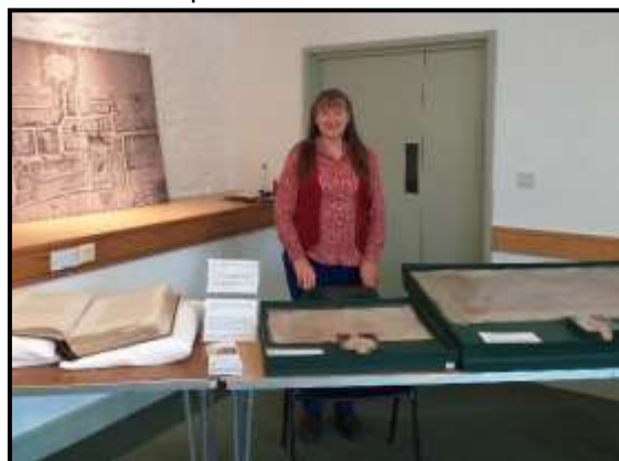
The City Archivist displaying documents to the Richard III Society.

The City Archives is delighted to be a partner in the major photographic exhibition “The Changing Shops of Wells in Photographs”, which opened at the Museum on 16 April 2022 and will run until 6 June. The collaborative partnership also includes the Museum, Project Factory, Somerset Film and Wells Civic Society. The display uses photographs of the main shopping areas of Wells, taken from the Phillips Collection held by the Museum, the Patrick Brown collection held by the City Archives (showing the buildings in the 1970s and 1980s), and the Millennium photographs commissioned by Wells Civic Society. In the future, the collection will be used in outreach learning through the museum’s Learning Officer with schools, residential homes, history groups and researchers.